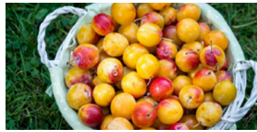
Products made from Mirabelle plums (local fruit): jams, fruit juices, sweets, etc.