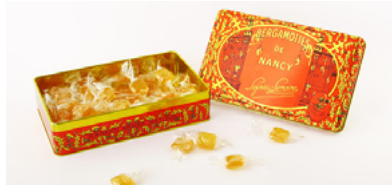
Bergamot of Nancy, a symbol of Nancy's confectionery craft since the 19 th century.

Nancy is not only renowned for its rich cultural heritage but also for its exceptional culinary specialties. By sponsoring one of these iconic delicacies, your company can connect with conference attendees through the unforgettable flavors that define the region's gastronomic identity. Here are a few examples of Nancy's specialties: