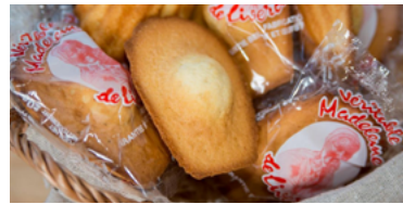
Madeleine of Liverdun