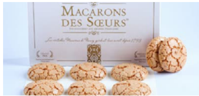
Macarons of Nancy